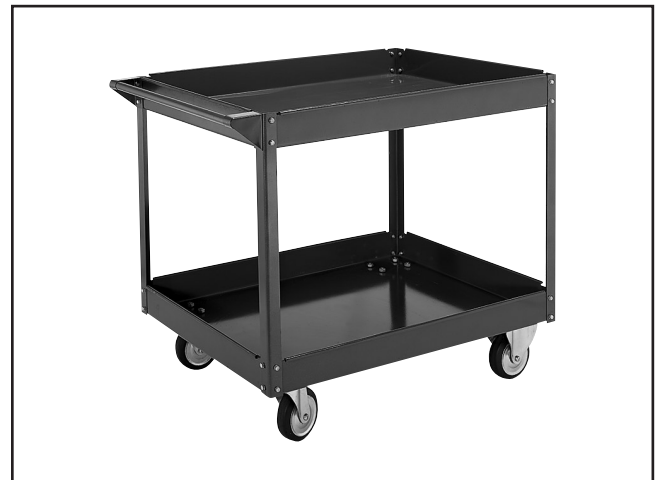
Figure 1. Model G7113.

If you need additional help with this procedure, call our service department at: (570) 546-9663.