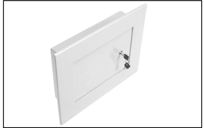
Figure 1. Wall Safe.

If you need additional help with this procedure, call our service department at: (570) 546-9663.