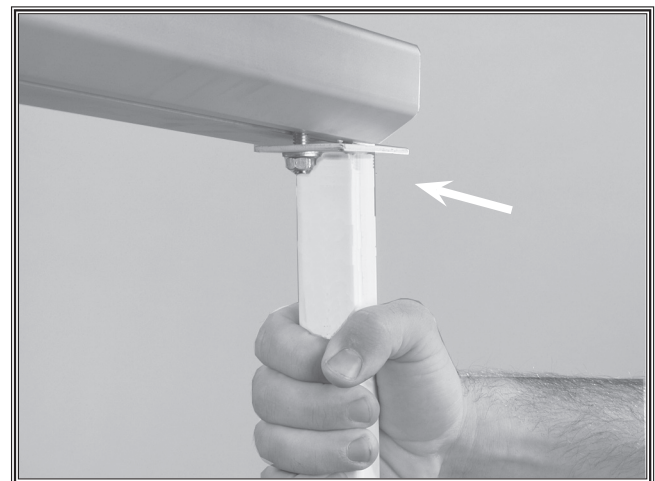
Figure 2. Sliding leg onto rail.

COPYRIGHT © APRIL 2004, BY WOODSTOCK INTERNATIONAL, INC. WARNING: NO PORTION OF THIS DOCUMENT MAY BE REPRODUCED IN ANY SHAPE OR FORM WITHOUT THE WRITTEN APPROVAL OF WOODSTOCK INTERNATIONAL, INC. PRINTED IN TAIWAN.