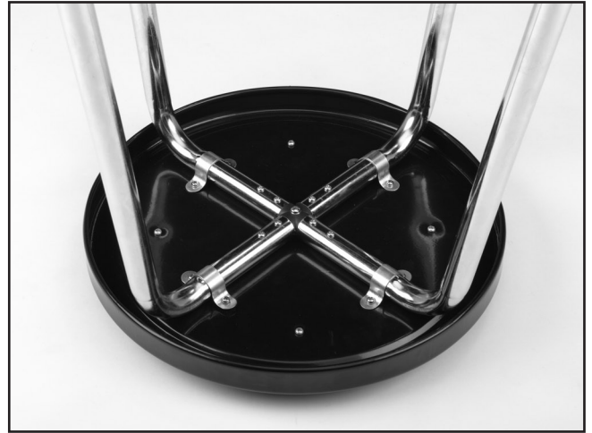
Figure 3. Installed stool pad and legs.