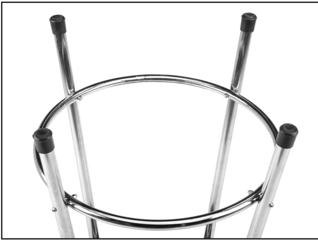
Figure 2. Correctly installed round brace.