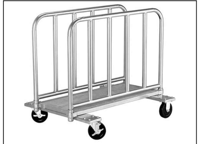
Figure 1. Model H7544.