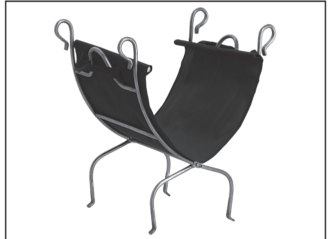
Figure 1. Model H7806.

If you need additional help with this assembly, call Technical Support at: (570) 546-9663.