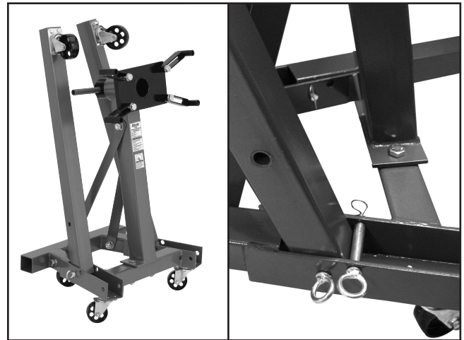
Figure 1. T10030 with legs folded.

When the stand is not in use, fold the legs up by removing the cotter pins from the eyebolt clevis pins. Remove the eyebolt clevis pins and fold the legs upwards until they clear the second placement hole, then re-insert the eyebolt clevis pins and cotter pins, as shown in Figure 1 .