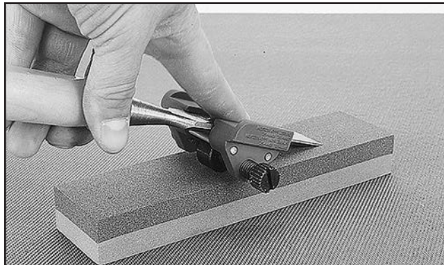
Figure 2. G1482 Honing Guide.

Accurate bevels are easily achieved using this honing guide. Very easy to use and a must for any chisel owner. It can also be used for plane irons up to 2 5 / 8 " wide and chisels up to 1 5 / 8 " wide. If you've tried sharpening blades by hand then you know that this is one tool you must have!