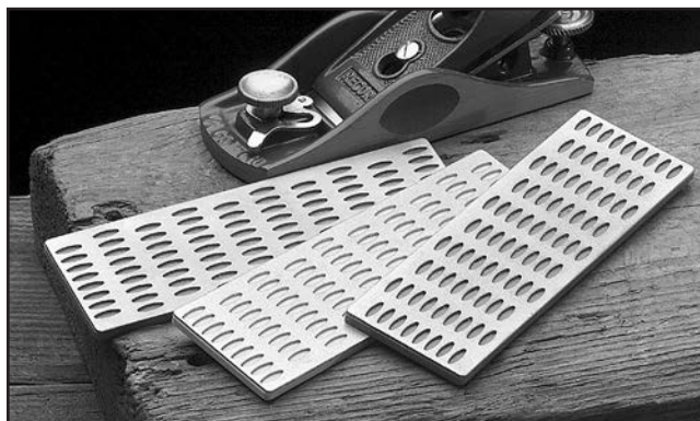
Figure 3. H2927 3-Pc. Diamond Whetstone Set.

Includes extra fine, fine, and coarse grades. Quick, easy and effortless sharpening. No oil lubrication needed. Only requires water. Extremely durable.