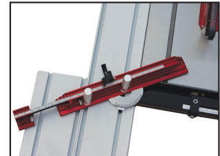
Angled Cuts with Slider