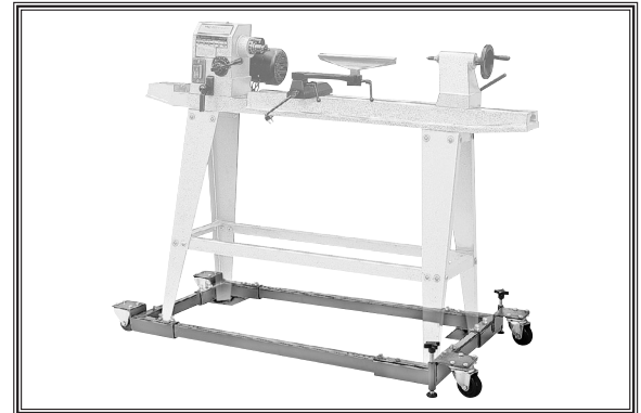
Figure 1. Model D2246A in use with D2058A mobile base and a wood lathe.

Follow all applicable steps outlined in the D2058A manual for mounting and using the machine, and heed all warnings to reduce the risk of serious injury.