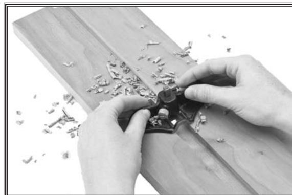
Figure 2. Using router plane.