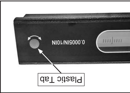
Figure 2. Location of adjustment screw.