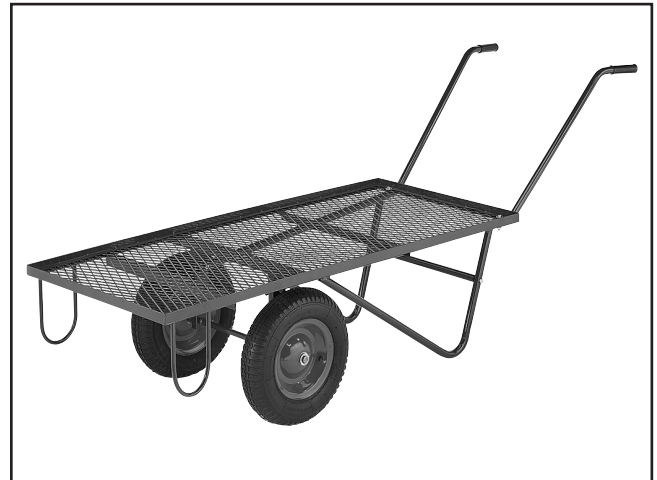
Figure 1. Model H3032.

If you need additional help with this procedure, call our service department at: (570) 546-9663.