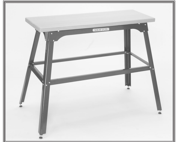
Figure 1. Model D3640.

If structural parts are missing please contact Woodstock International for replacements. For the sake of expediency, replacements for non-proprietary parts can be obtained at your local hardware store.