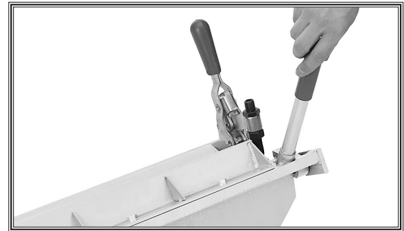
Figure 5. Breaker bar lever installation.