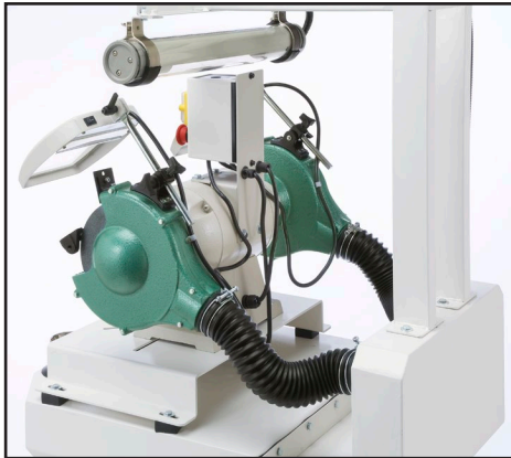
Dual 2½" dust collection inlets